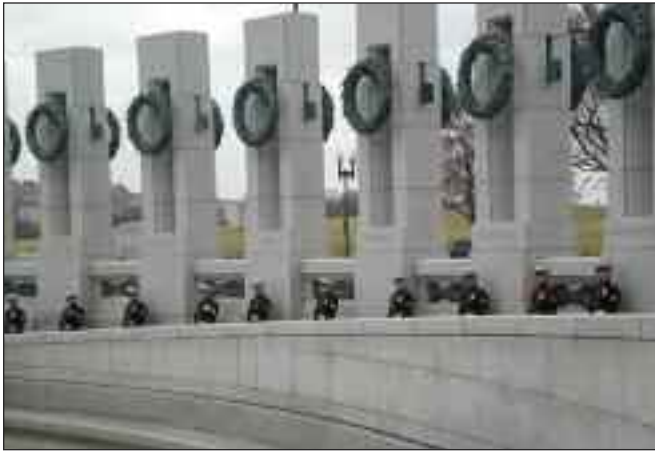
The procession into the memorial lined with Marines

and to take pictures; they were given a box lunch and then taken to the Iwo Jima Memorial. They returned to the hotel for a banquet dinner and then were given the opportunity to view the opening of the miniseries The Pacific . The movie Casablanca was also offered as an alternative to anyone who thought reliving