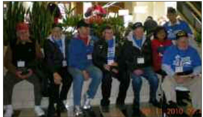
Honor Flight Long Island team 4 waiting to see the memorial

My dad was a member of the Navy during WW II. He was stationed off the coast of California patrolling the Pacific. I found out that the Honor Flight Network has hubs in many states and there was a hub on Long Island in New York, the Honor Flight Long Island. I got him an application and was thrilled when he was called for a flight 10-12 March. What normally would have been a one day trip to the memorial and back turned out to be a one day two-night tribute to WW II vets stationed in the Pacific. HBO was just releasing their new miniseries