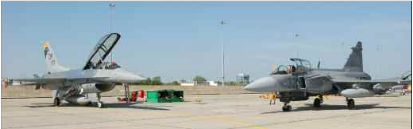
A 178th Fighter Wing F-16 Fighting Falcon and a Hungarian Air Force JAS-39 Gripen during the Load Diffuser Exercise 2010 in Kecskemet, Hungary April 29. The exercise aims to sharpen the combat capabilities of the participating forces by conducting a 10 to 15 day flying program.

K ECSKEMET, Hungary— Approximately 100 members of the 178th Fighter Wing from Springfield, Ohio, deployed in support of the Load Diffuser Exercise 2010, April 22 to May 7 to Kecskemet, Hungary.