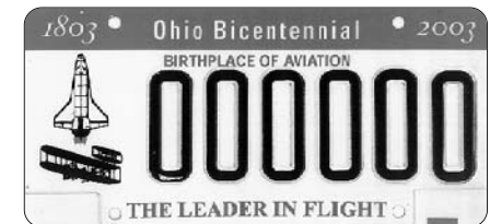
Leader in Flight! License Plate

Wright "B" Flyer Inc., a totally volunteer non-profit charitable Dayton-based organization dedicated to the preservation and re-enactment of historical aviation achievements, would appreciate your help as they celebrate the 100th Anniversary of Powered Flight. You can proclaim Dayton's heritage and also help the Wright "B" Flyer by asking for the "Leader in Flight" license plate when you purchase a new vehicle or renew your current vehicle license. This attractive commemorative license plate which depicts the Wright "B" Flyer and the space shuttle costs only $25 additional, or the same as any other special license plate, and $15 of every plate goes to support the Wright "B" Flyer. For more information please call the Wright "B" Flyer at (937) 885-2327.