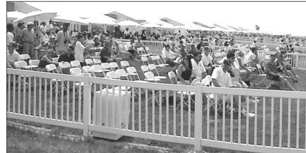
Guests Arrive early to enjoy 2002 Dayton Airshow

The AFA Chalet at the Dayton Air Show is a co-sponsored venue jointly funded by the local Wright Memorial AFA Chapter (WMC) and numerous industry partners including Boeing, Lockheed Martin, Rockwell Collins, Raytheon, GE Aircraft Engines, Pratt & Whitney, Northrop Grumman, Battelle, CACI, Dynamics Research Corporation, HJ Ford, and Intergraph Solutions Group.