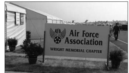
AFA Chalet Entrance at 2002 Dayton Airshow

The Air Show Chalet area is restricted to ticket holders. With a chalet ticket, the holder will be allowed into the Air Show grounds and static display areas, be permitted to ride the chalet shuttle buses, and have access only to chalet #15 (or the designated AFA chalet entrance). Refreshments will be available each day to chalet ticket holders. The Dayton Air Show gates open at 8:00 a.m. and flying begins at approximately 9:30 a.m., ending at approximately 5:00 p.m. each day. To learn more about the Air Show events, visit web site: http://www.airshowdayton.com or http://www.usats.org .